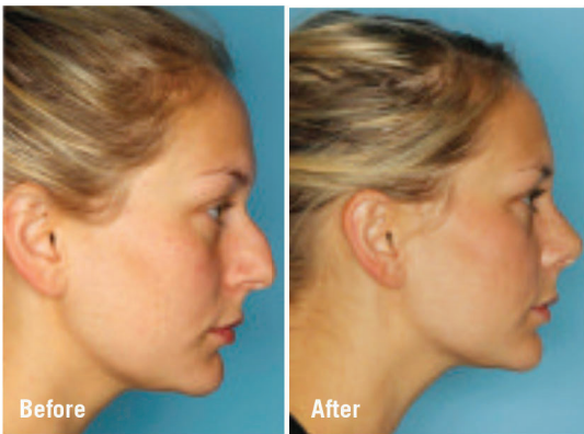
The trend in rhinoplasty is to create strong, well-defined noses.